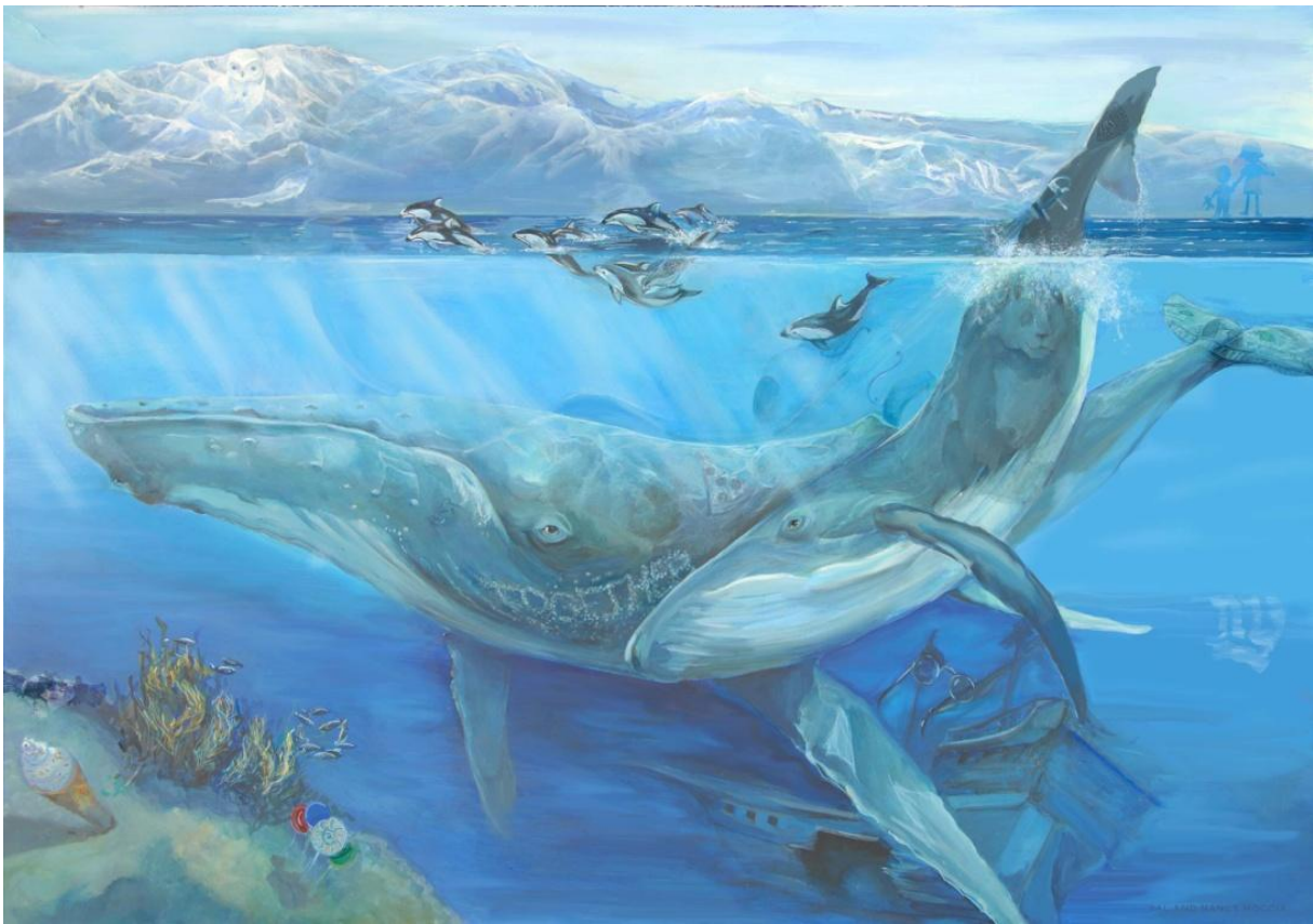
CMF Logo in the clouds, Ice Cream Cone, beautiful colorful balloons...