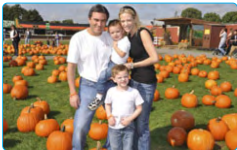
The Fortunoff Family

SAVE THE DATE: SUNDAY, 9/26/10 FAMILY FUN DAY AT WHITE POST FARMS!