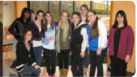
Herricks Youth Against Cancer Club