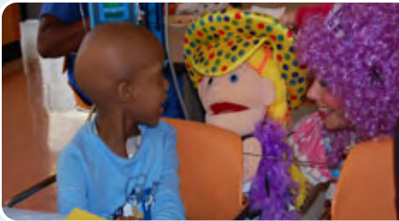
New Years Celebration

Halloween Patient Party: What a wonderful day for the annual Children's Medical Fund Halloween party. The party was sponsored by The Greater New Hyde Park Chamber of Commerce, New Hyde Park Lions Club, and Garden City High School CMF Club. The day included toys, crafts, wonderful holiday cupcakes, drinks and ice cream sundaes for all.