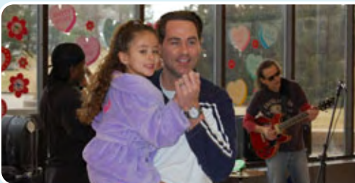
Patient & her Dad enjoying Valentine's Day Festivities