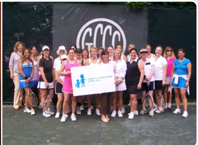
Garden City Chapter Tennis Attendees