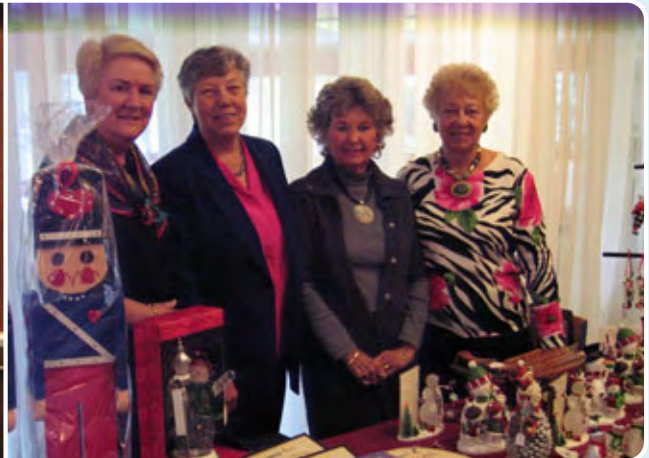
Garden City CMF Boutique