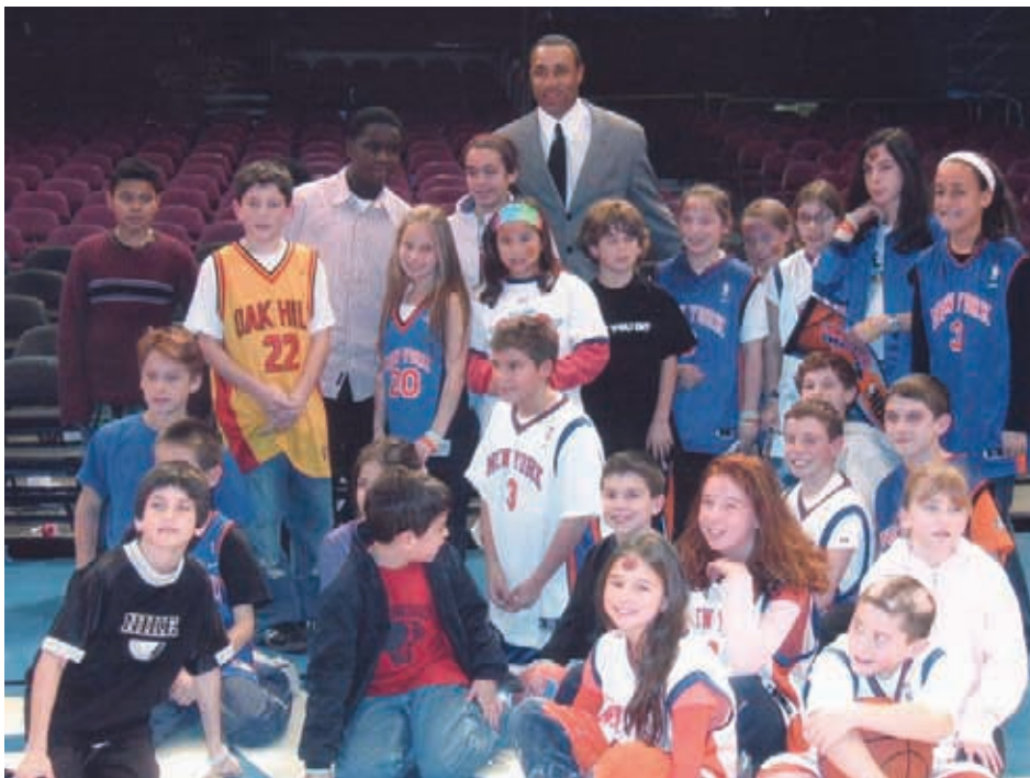
Children of CMF members with former Knicks guard John Starks