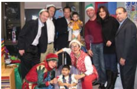
Men's Division Holiday Patient Party.