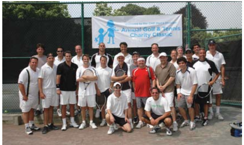
Tennis players take a break from the action.