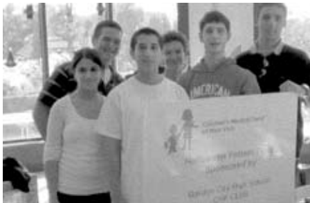
Garden City High School CMF club at Halloween Patient Party.