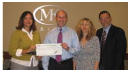
Marcum & Kleigman presents donation of $22,500 to CMF from their Workplace Challenge road race.